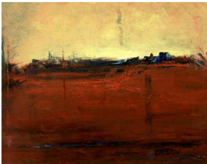
"You Too I Welcome"

Award of Merit, 2009 California State Fair