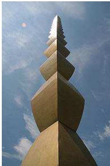
"The Endless Column"

And, humbly (very humbly) putting my work next, two paintings of mine . . .