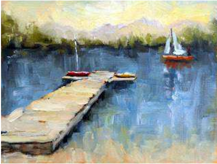
"Red Sailboat on Fallen Leaf Lake", Holly Van Hart

This last work (very humbly put after the two above it) is mine; it was painted on the beach of a charming little lake in California during a weekend getaway.